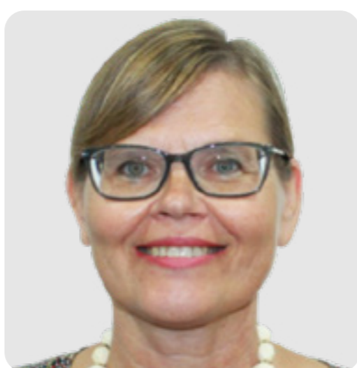
TAINA SATERI HEAD OF SECTION TRADE AND OTHER POLICIES, EU DELEGATION IN UAE